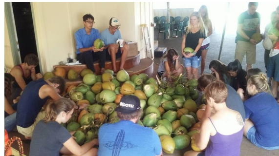
Students praying over the coconuts before the festival.